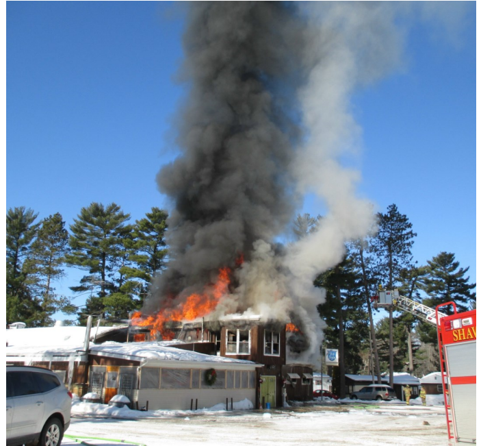
Flames shoot from the entrance to the Rustic Resort during the early stages of a fire that destroyed the building on Feb. 19.

The fire's cause was not determined. It broke out on the morning of Feb. 19 and was fought by firefighters from Shawano, Clintonville, Embarrass, Pulaski, Navarino, Bonduel and Waupaca throughout the day.