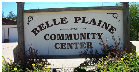
Belle Plaine Community Center