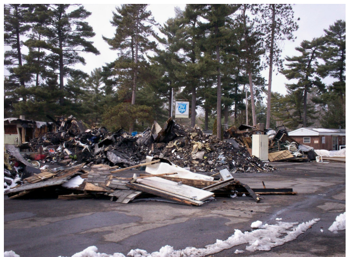
Cleanup efforts begin at the site of the fire that destroyed the Rustic Resort.